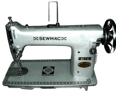
95-T 10 MODEL