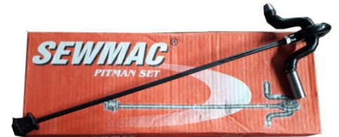
ROD & BALL BUSH