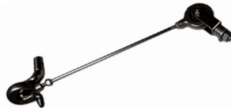
ROD & BALL BUSH