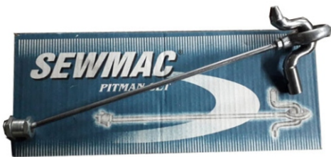
ROD & BALL BUSH