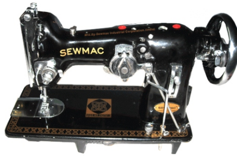
ZIG ZAG MODEL