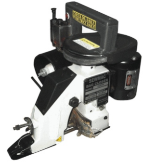
PORTABLE BAG CLOSER